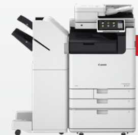
iR-ADV DX C5800