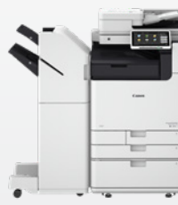
iR-ADV DX 6800