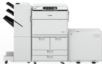
iR-ADV DX 8700