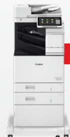
iR-ADV DX C478