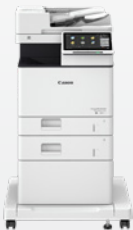
iR-ADV DX 717/617/527