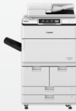
iR-ADV DX 6780i