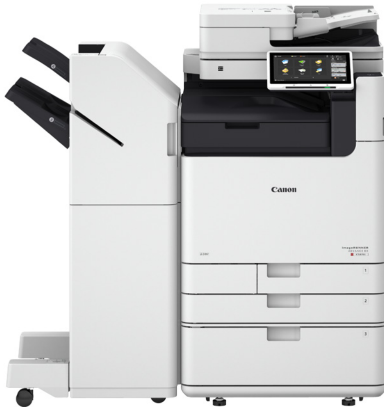
iR ADV DX C5800

The latest imageRUNNER ADVANCE C5800 Series produces up to 18% less CO2 and weighs 20% less than its predecessor.