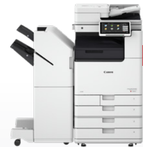
iR-ADV DX C3800